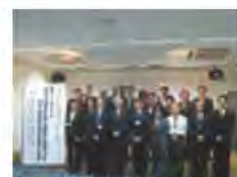
Participants with full of willingness

ICCAE organizes the open forum every year to discuss important and contemporary topics concerning international cooperation in agricultural education. Prominent researchers and practitioners are invited to the forum, which is open to the public. Furthermore, researchers and experts will be invited to give seminars on their own work to researchers, students, and the public as well. Six or more seminars are held in a year.